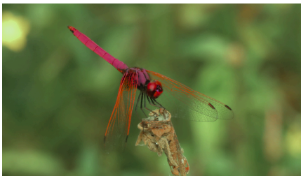
Red Spotted Dragonfly

Fungi, Algae and Moss are a few introverted qualitative bioindicators, who only sprout in the right environments. Their arrival can be predicted like a bride to her groom, but they may shy away if approached with hostility. And this is how we know we are doing something right. Dragonflies too, they lay their eggs on clean still water, preferably a naturally formed puddle in nutrient rich soil, we love a pop of red!