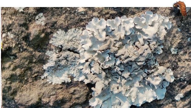
More than one relationship may often bloom!

For those who may be unaware of Raah Foundation, we are a team of 150 personals, piecing together balanced ecosystems by working at the nexus of the planet and its people. One of our in-house specials is the re-wilding project we're carrying out over the hills of Nashik, situated in the Western Ghats of Maharashtra. To bring back the dense tropical evergreen forests that once canopied the Indian West Coast, it seemed quite obvious that we would have to bring back native species that once thrived in these soils. In the process of doing so, the native saplings we planted met us half-way and re-built ancient ecosystems that surely existed before you and I. These ancient ecosystems defined the term 'relationship' long before God placed Adam and Eve on earth, and we're just about re-discovering them.