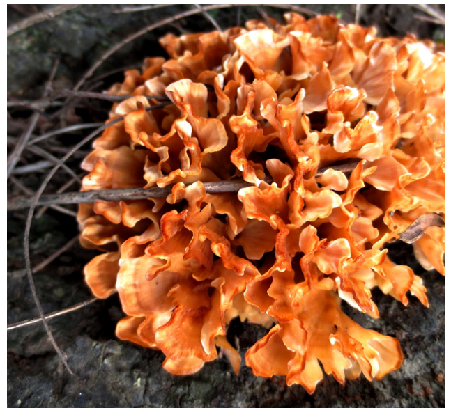
Chicken of the Woods Mushroom